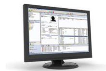
Exgarde™ Pro Security Management Software