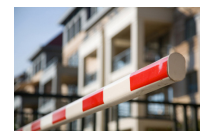
Long Range Car Park Reader