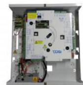
Expert 4 IP Controller