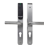
Assa Abloy Aperio E100 Locks