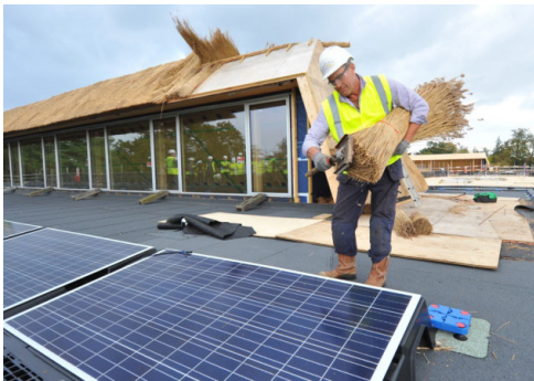
Thatching the Solar Roof

The Enterprise Centre has been realised as UEA and Norfolk's showcase low carbon building, and one of the UK's greenest commercial buildings. It is an inspirational example of the potential for sustainability-aware architecture and local, bio-renewable materials. A range of business tenants form a vibrant and successful green business hub, operating alongside teaching and learning space. The building is also an inspirational venue for meetings and events. Multi-award winning, the building has received a multitude of accolades. Current